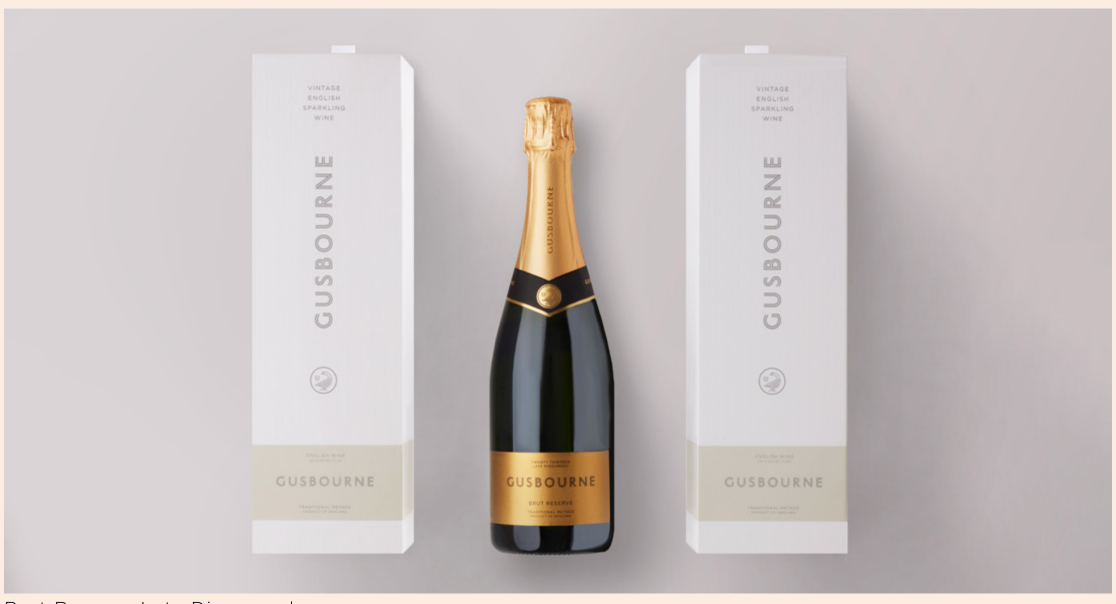
Brut Reserve Late Disgorged