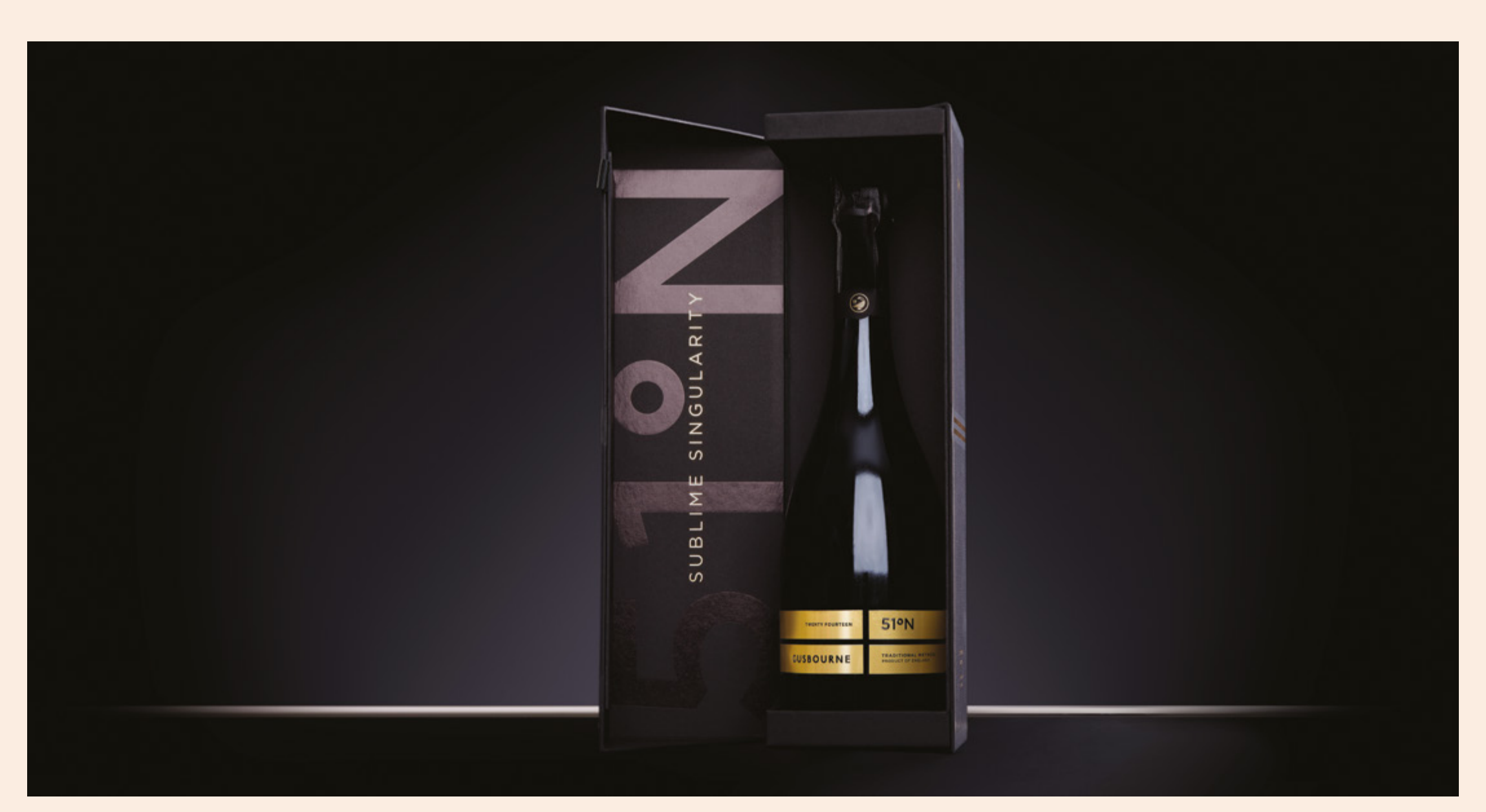
Fifty One Degrees North